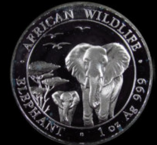
2015 100 Shillings Mintage NA