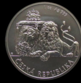
2017 Czech Lion Mintage 10,000