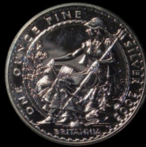
2005 Britannia Mintage 100,000