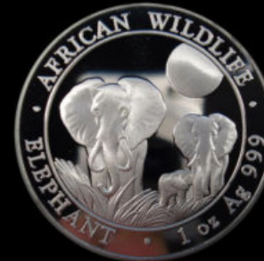
2014 100 Shillings Mintage NA