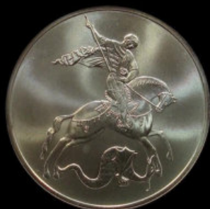
2009 St. George & Dragon Mintage 280,000