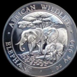
2013 100 Shillings Mintage 130,000