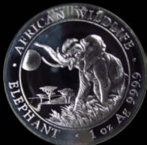
2016 100 Shillings Mintage NA