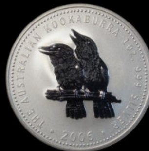
2006 Kookaburra Mintage 87,044