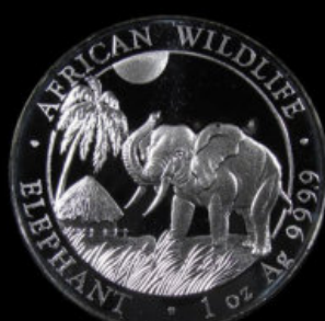
2017 100 Shillings Mintage NA