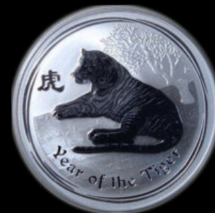
2010 Year of the Tiger Mintage 56,077