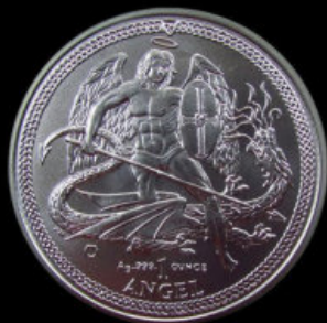
2015 St. Michael-Dragon Mintage 100,000