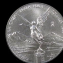
2014 1/4 Onza Mintage 6,950