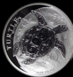
2015 Hawksbill Turtle Mintage NA