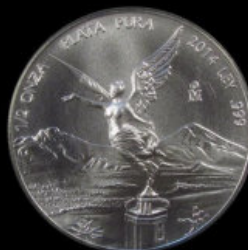
2014 1/2 Onza Mintage 17,000