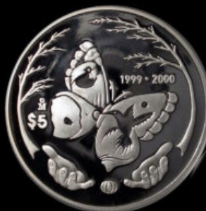
1999-2000 Millennium Mintage 47,435