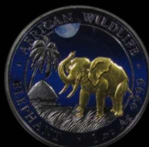
2017 Sunset Elephant Black Ruthenium & 24kt Gold Mintage 200