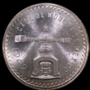
1949 Onza Mintage 1,000,000