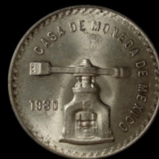
1980 Onza Mintage 6,104,000