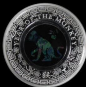
2018 Opal Lunar Monkey Mintage 5,000