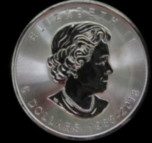
1988 Maple Leaf First Year Mintage 1,155,931