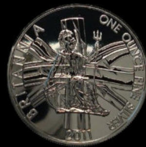
2011 Britannia Mintage 100,000