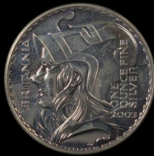
2003 Britannia Mintage 73,271