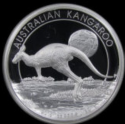
2015 Kangaroo High Relief Proof Mintage 18,000