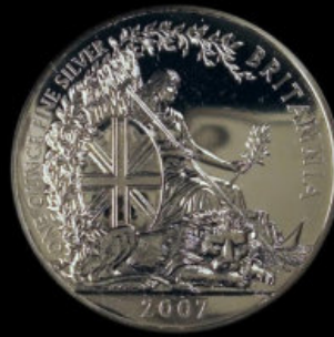
2007 Britannia Mintage 100,000