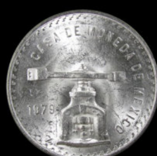
1979 Onza Mintage 4,508,000