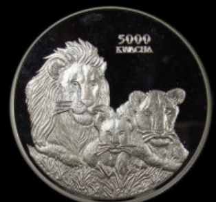
1999 Lions Mintage NA