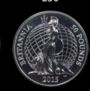
2015 £50 Mintage 50,000