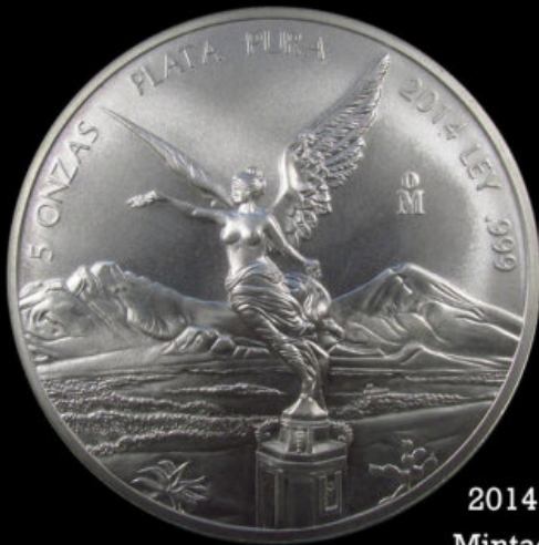
2014 5 Onza Mintage 6,400