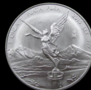
2015 Libertad Mintage 901,500