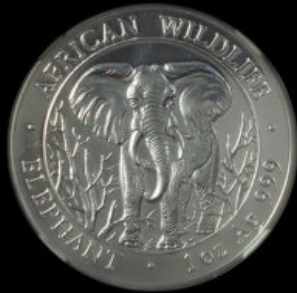
2004 1000 Shillings Mintage 5,000