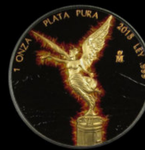
2015 Burning Libertad Black Ruthenium and 24K Gold finish Mintage 1,000