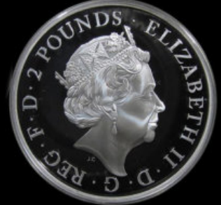
2013 Britannia Proof Mintage 8,500