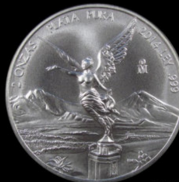
2014 2 Onza Mintage 9,000