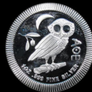
2017 Athena's Owl Mintage NA