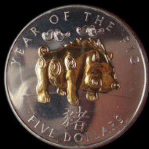
2007 Year of the Pig Mintage 10,000