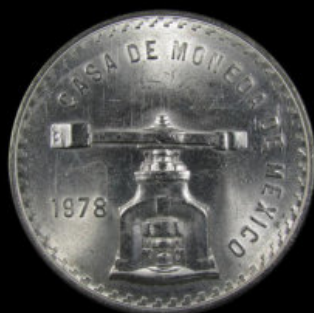
1978 Onza Mintage 280,000