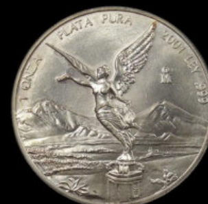
2001 Libertad Mintage 768,600