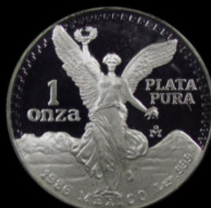
1986 Libertad Proof Mintage 30,006