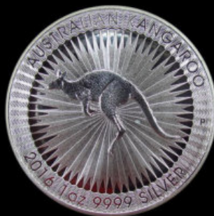
2016 Kangaroo Mintage 11,245,616