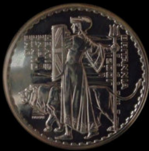
2001 Britannia Mintage 44,816