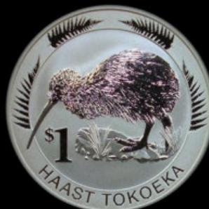
2008 Kiwi Proof Mintage 5,000