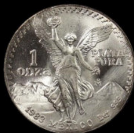
1983 Libertad Mintage 1,001,768