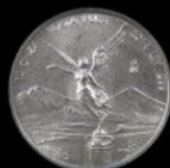
2014 1/10 Onza Mintage 6,350