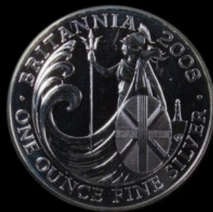
2008 Britannia Mintage 100,000