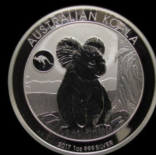
2017 Koala Kangaroo Privy Mintage 50,000