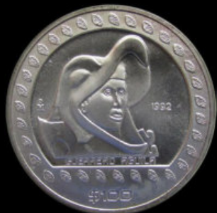
1992 Eagle Warrior Mintage 205,000