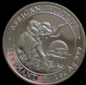
2009 100 Shillings Proof Mintage 5,000