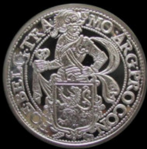
2017 Re strike of 1662-1668 Lion Daalder Mintage 25,000