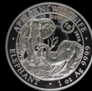
2018 100 Shillings 15th Anniversary Mintage NA