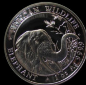
2018 100 Shillings Mintage NA