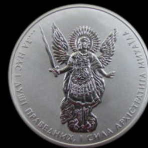
2016 St. Michael-Archangel Mintage 24,705