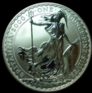
2000 Britannia Mintage 81,301