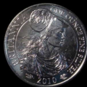
2010 Britannia Mintage 126,367