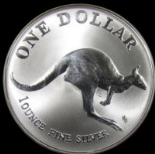
1993 Kangaroo Mintage 5,000