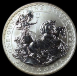
1999 Britannia Mintage 69,394