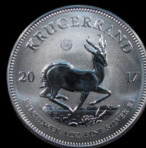
2017 Krugerrand Mintage 1,000,000