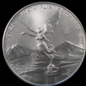
2014 Onza Mintage 429,200