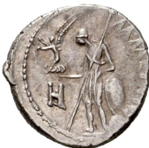
Fig. 2A = Rev. fig. 2 @ 200%