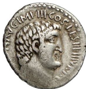
Fig. 3A = Obv. fig. 3 @ 200%