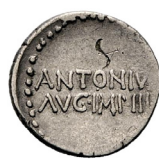
Fig. 3 – Denarius, RRC 542/1. Helios 7 (12/XII/2011), no. 71 (3.77 g)