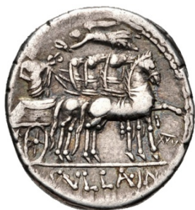
Fig. 1A = Rev. fig. 1 @ 200%