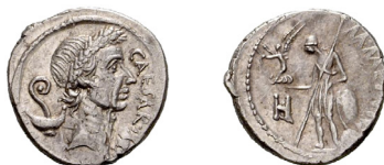
Fig. 2 – Denarius, RRC 480/3 (H, recut from G) NAC 33 (6/IV/2006), no. 357 (3.70 g)