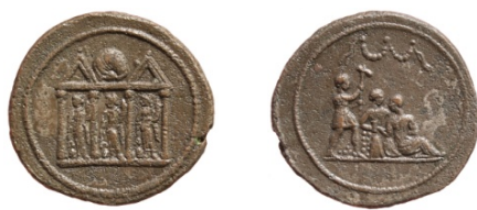
Fig. 7 – Tessera , Kunsthistorisches Museum Wien, Münzkabinett, inv. no. MK RO 32.652 (7.34 g, ↑↑)