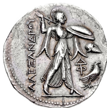
Fig. 5 – Tetradrachm, Ptolemy I Soter as satrap in the name of Alexander, c. 310-305 BC, Alexandria. SNG Copenhagen 19. CNG 88 (14/IX/2011), no. 534 (15.69 g, 17)