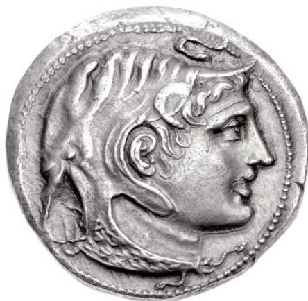
Fig. 5A = Obv. fig. 5 @ 200%