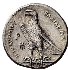
Fig. 6 – Tetradrachm, Ptolemy I Soter as king, c. 305-283 BC, Alexandria. SNG Copenhagen 72. NAC 59 (4/IV/2011), no. 657 (14.08 g)