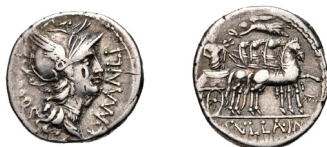
Fig. 1 – Denarius, RRC 367/5. CNG electronic auction 272 (25/11/2012), no. 323 (3.88 g, 1→)