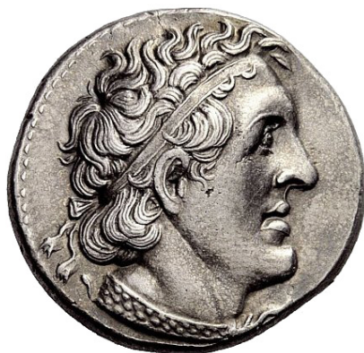
Fig. 6A = Obv. fig. 6 @ 200%