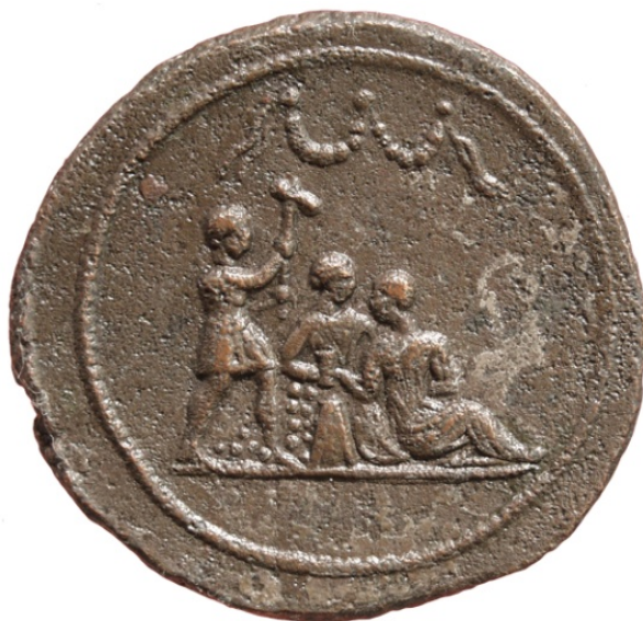
Fig. 7A = Rev. fig. 7 @ 300%