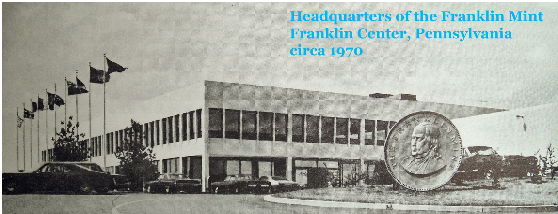
Headquarters of the Franklin Mint Franklin Center, Pennsylvania circa 1970