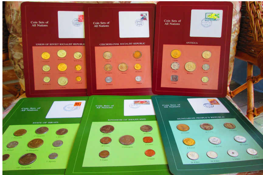
These are images of the older 1970s - 80s "Coin Sets of All Nations"